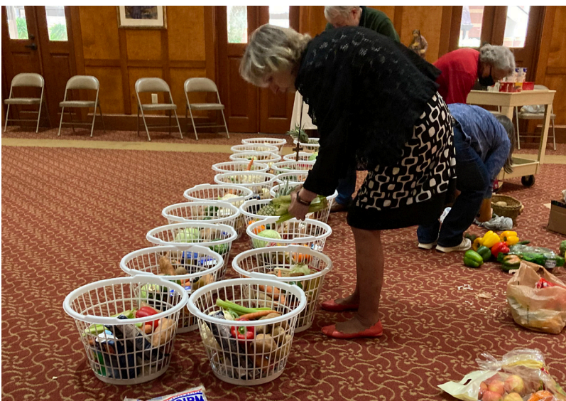
St. Vincent de Paul sorted the food on Sunday to distribute all the fresh food and more to the poor.