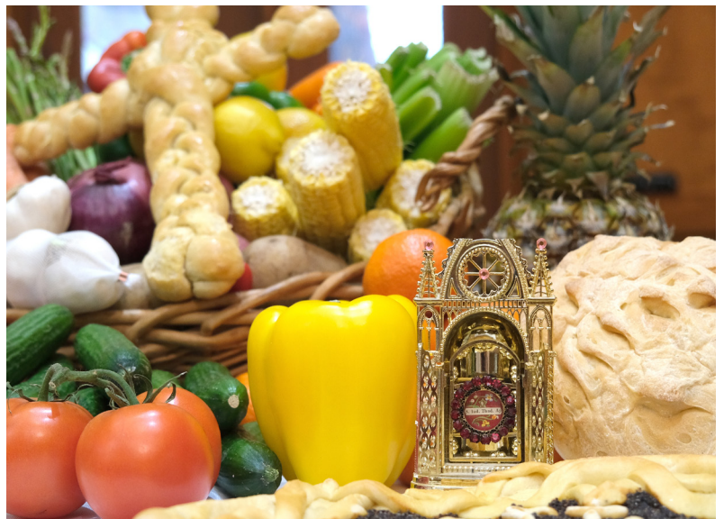
We were blessed to have first class relics of St. Joan of Arc, St. Matthew, St. Elizabeth and Seton, and many more present on the altar.