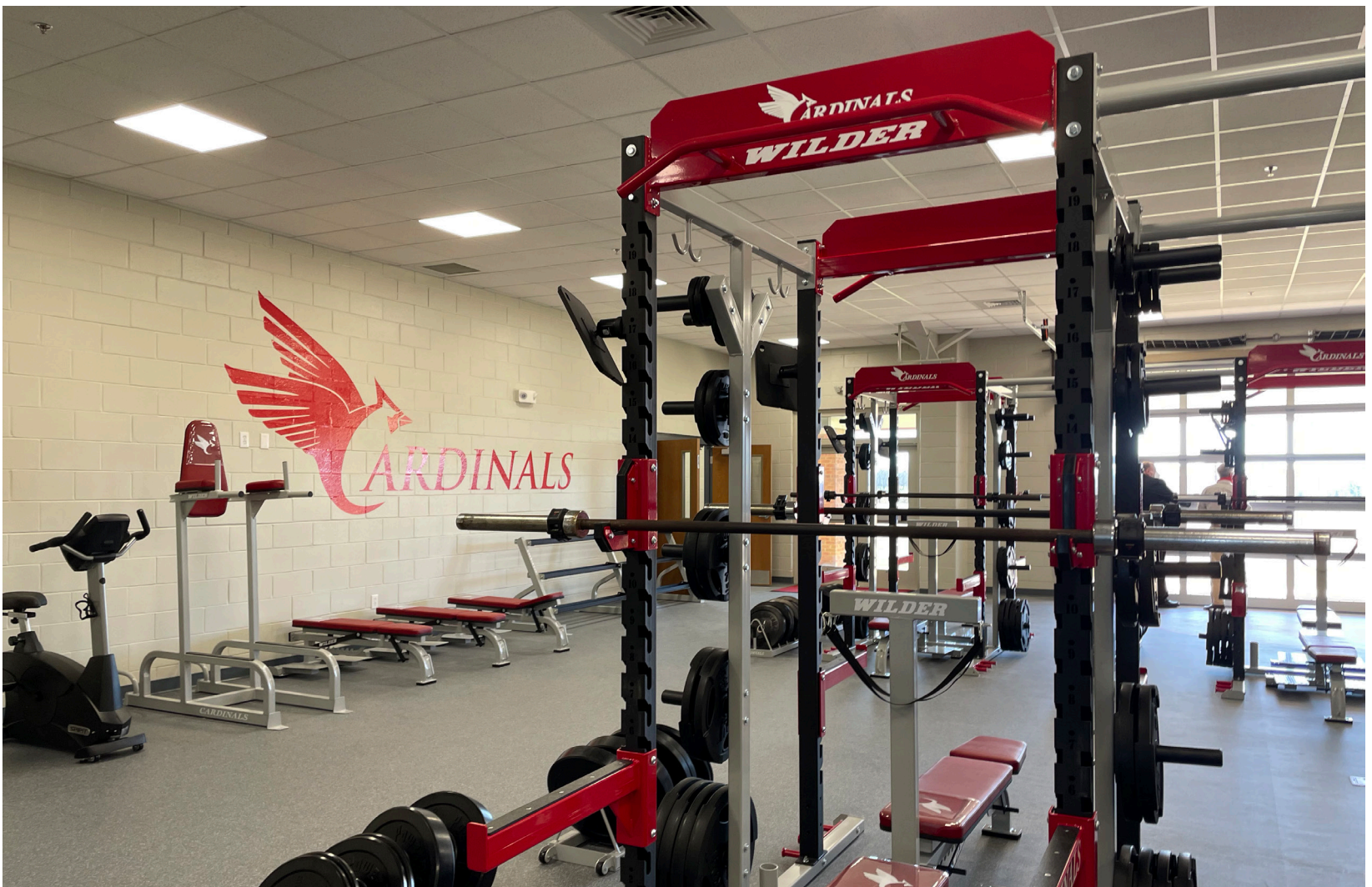
The new Rusty Cowles Athletic Field House has ample space, locker rooms and excellent equipment to help our student athletes prepare for competition.