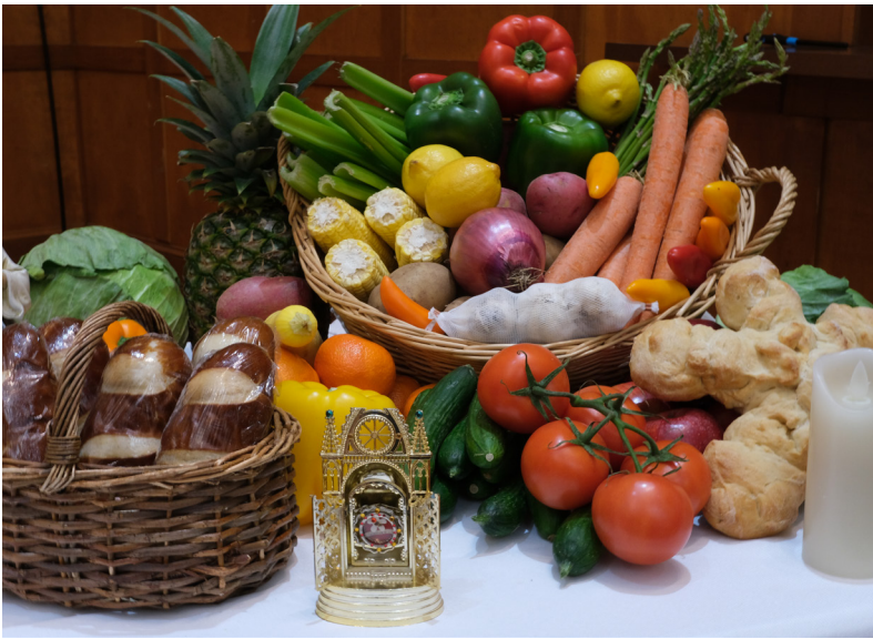
The abundance of fresh food and donations from the parish was overwhelming, and we are very grateful.