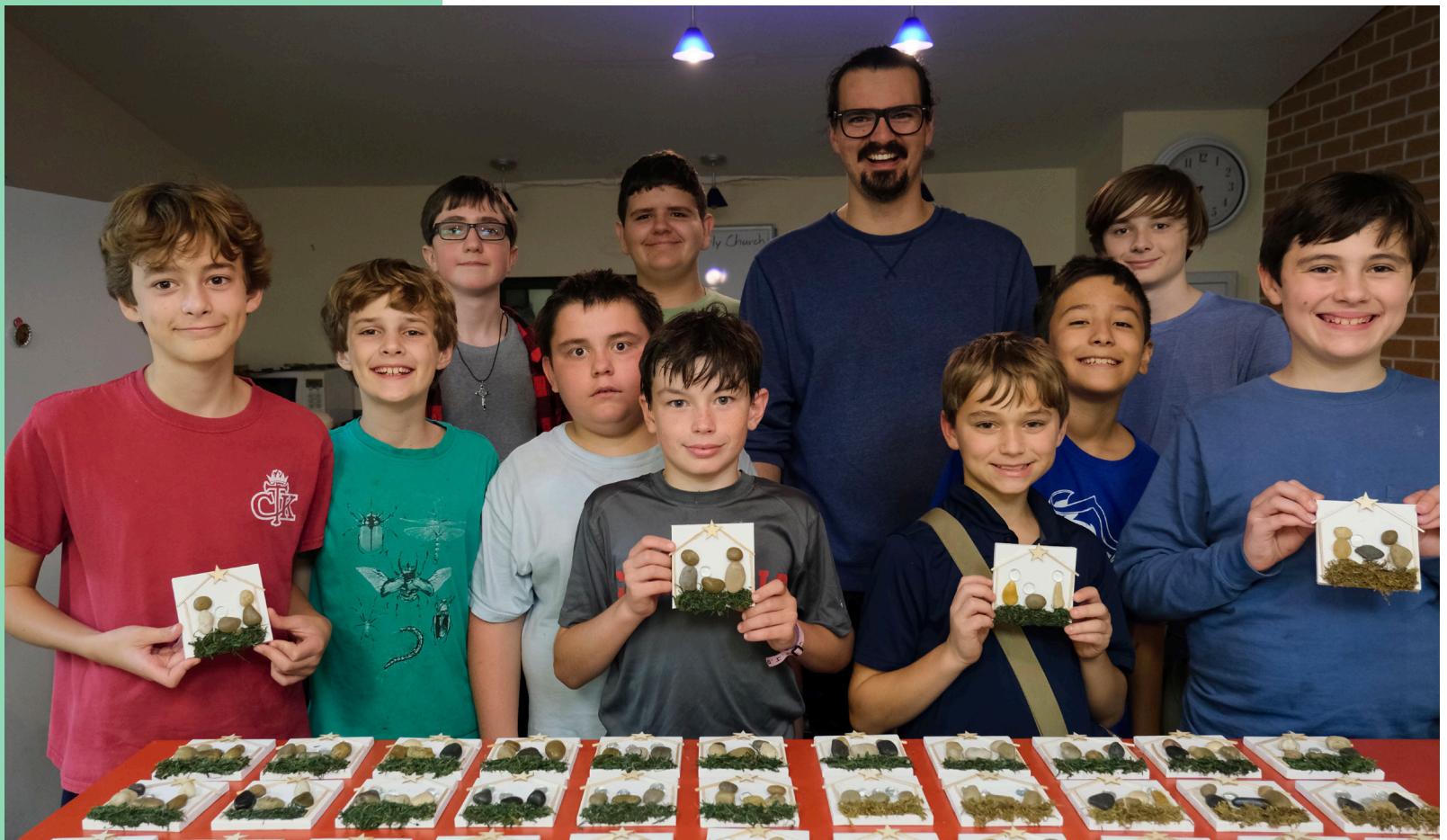
The Edge boys show off their nativity crafts proudly!