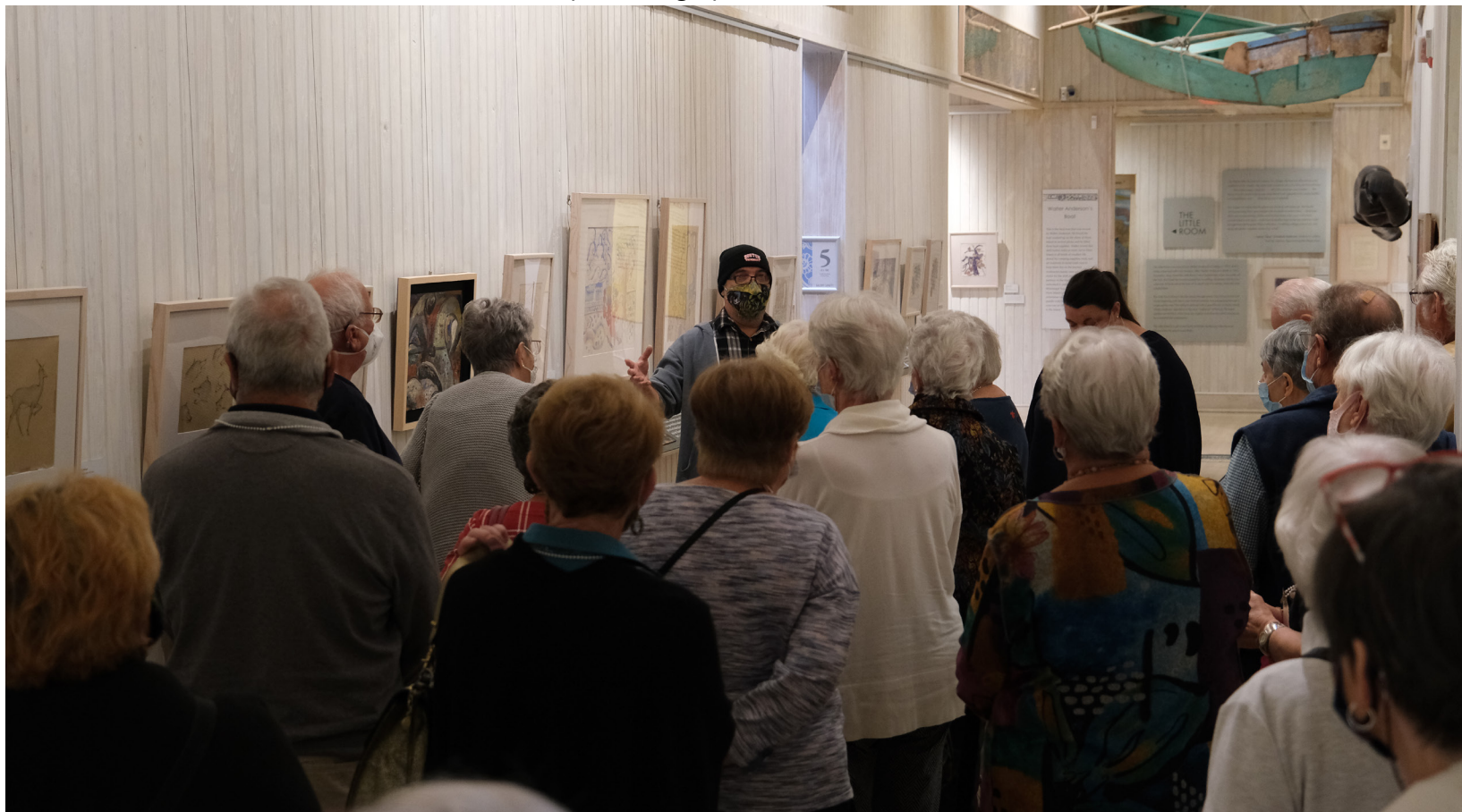
Our group enjoyed an extensive guided tour of the Walter Anderson Museum. There was a wide variety of his art mediums on display.

Treasures had a wonderful trip to the Biloxi area visiting two of the art museums there. The first stop was the Walter Anderson Museum of Art. The museum is dedicated to the preservation and celebration of artist-philosopher Walter Anderson with many of his paintings, drawings, sculptures, and carvings. Our next stop was at the Ohr-O'Keefe Museum of Art. This museum had many collections including those of George Ohr, the "mad potter" of Biloxi. His pottery wasn't rediscovered until over 50 years after his death in 1910. His pieces are varied and unique reflecting a wide array of lifestyles and experiences as later dabbled in creating unique shapes and colors. The clay Ohr used throughout his career was sourced from the local Tchoutacabouffa River. It was a wonderful day topped off with a tremendous meal shared at Mary Mahoney's. We are looking forward to our Christmas luncheon and our December trips coming up soon!