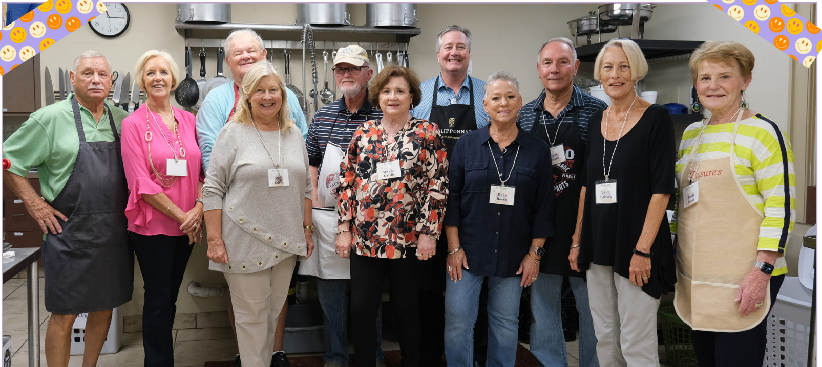
The Treasures cooking crew is the best in town!