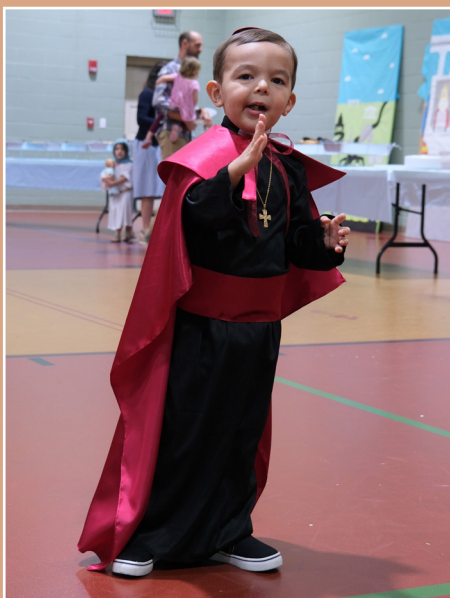
Venerable Fulton Sheen offers a blessing!