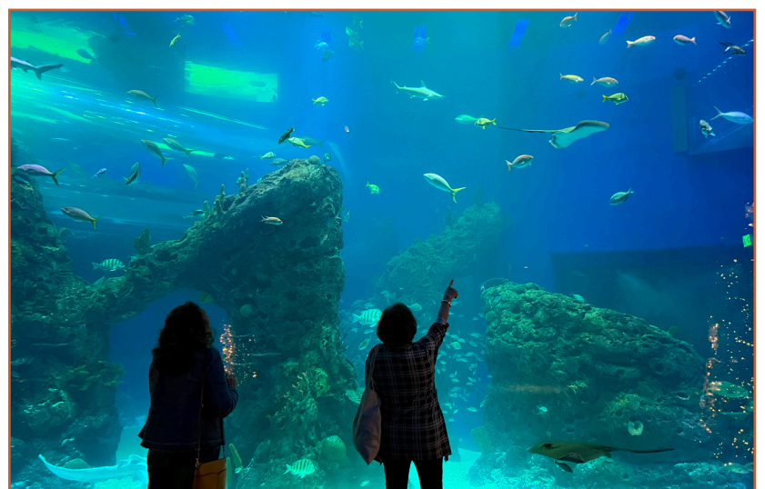
The sea life at the aquarium was a marvelous sight.