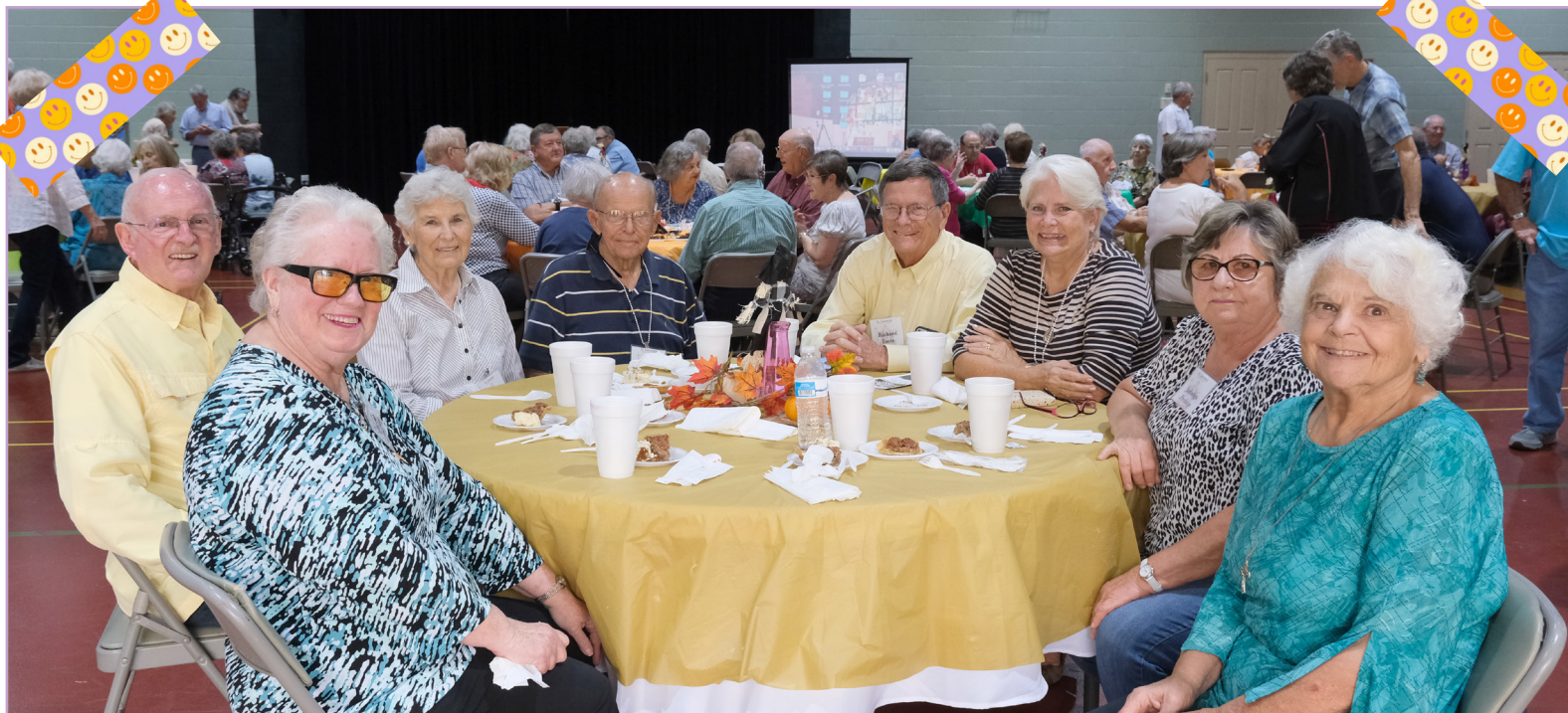
We always value the good company enjoyed at our luncheons.

As for our monthly luncheons, they never disappoint! The food, festivity, and friendship is always boosts the spirits of all in attendance. We hope you will join us in January as we gather again!