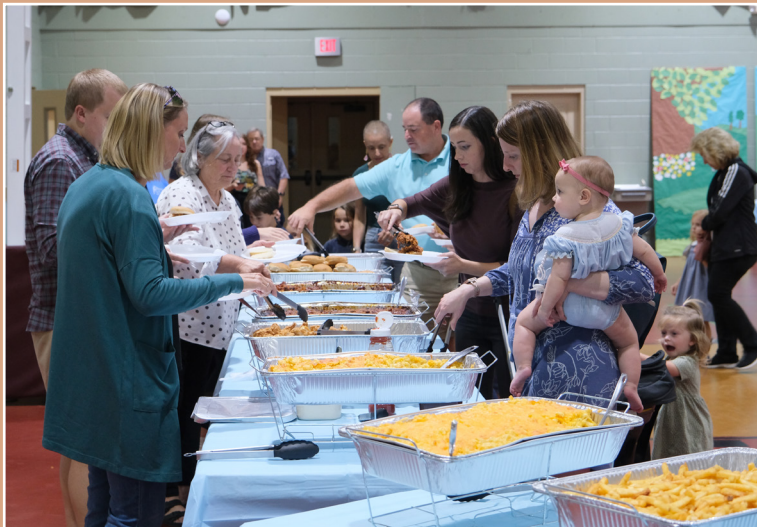
Pulled Pork and Mac & Cheese was delicious.