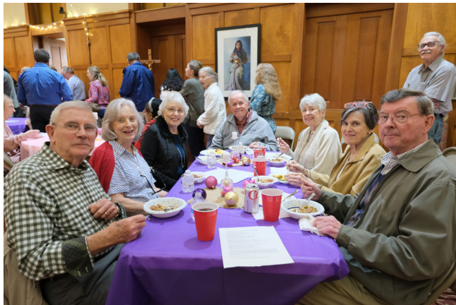
The friends and fellowships were a real treat!