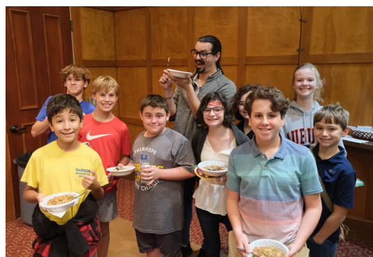
EDGE kids stopped in for treats and fun!