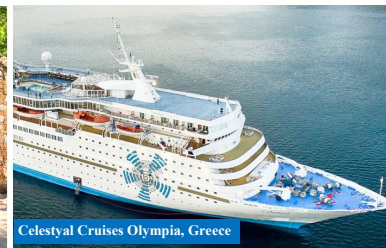
Celestyal Cruises Olympia, Greece