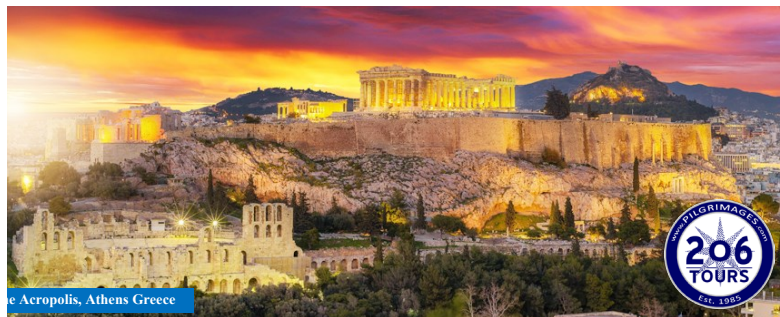
Acropolis, Athens Greece