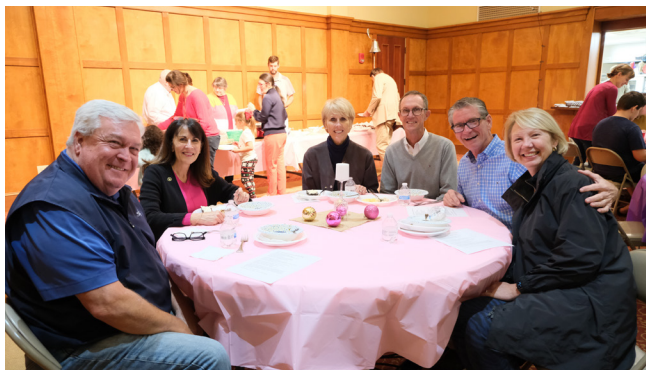
Great company made the consecration and meal a wonderful experience for all.