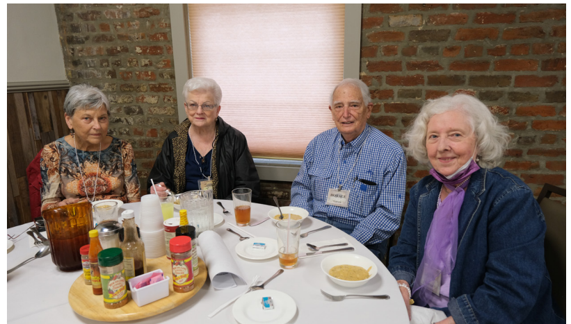
The meal we shared was almost as wonderful as the company.