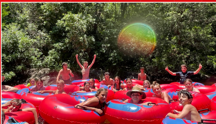
All the edge students were pumped to be tubing!