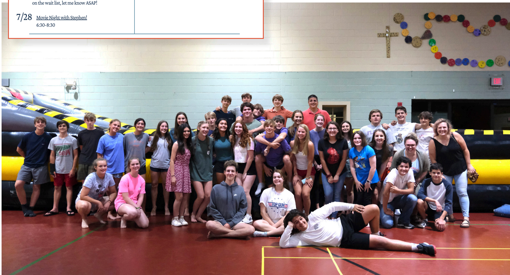
A great night to welcome our new freshman!