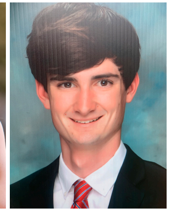
Hamp Repdl McGill-Toolen HS