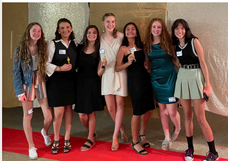
The lovely ladies on the red carpet.