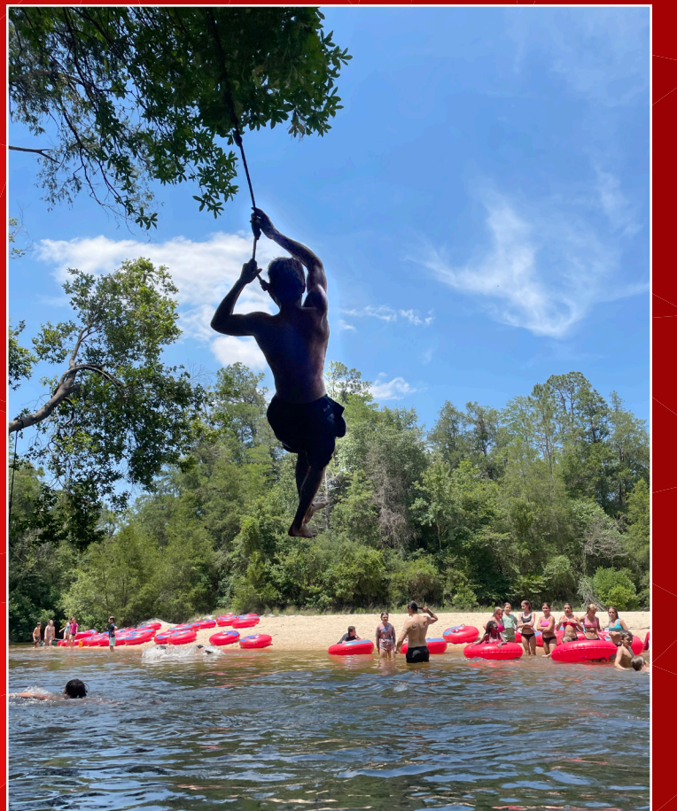
The rope swing was a big hit on the river.