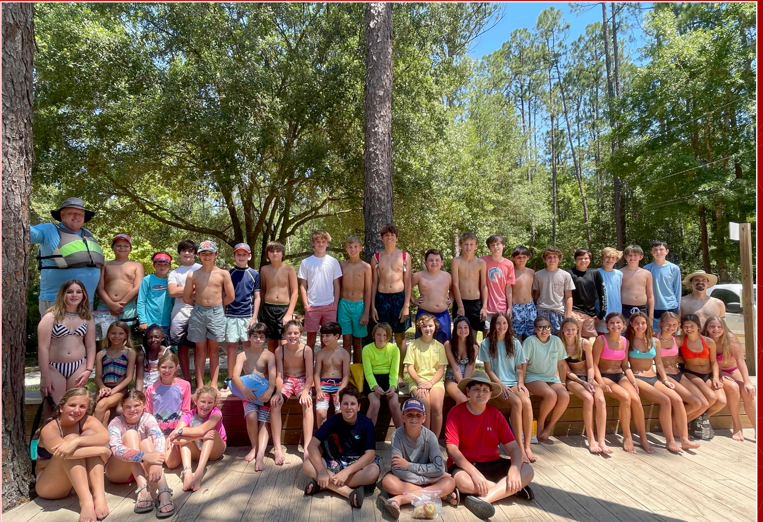
Getting ready to tube down the Blackwater River!