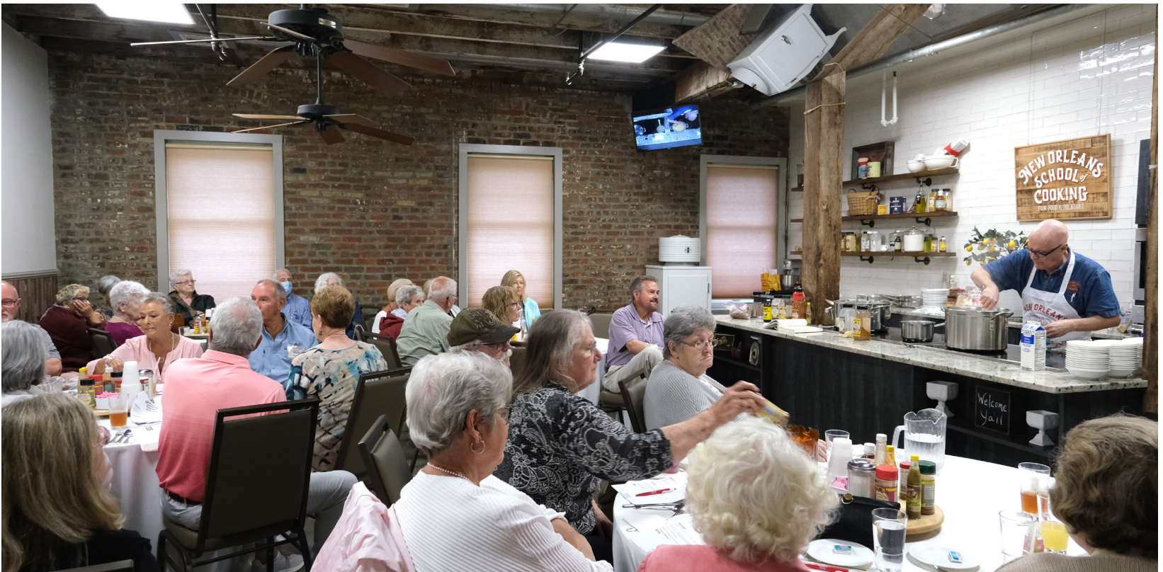
We were happy to take a group of old friends and newcomers to New Orleans for Cooking School.