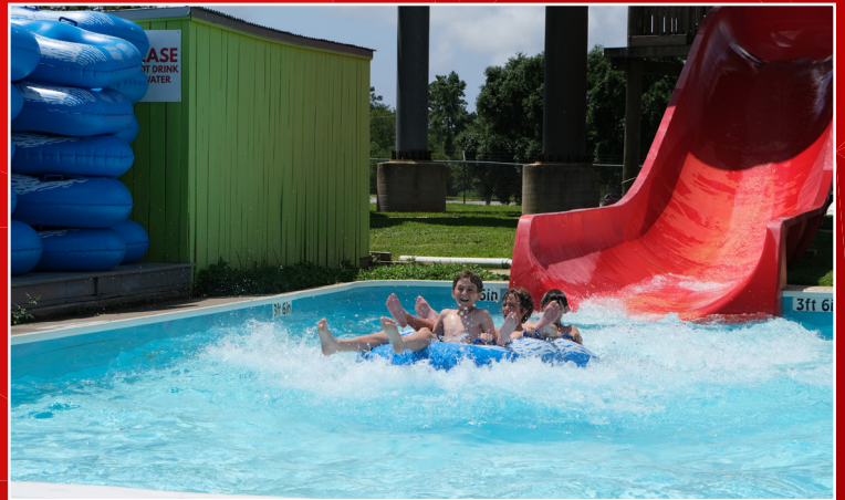
Hitting the water with a splash!