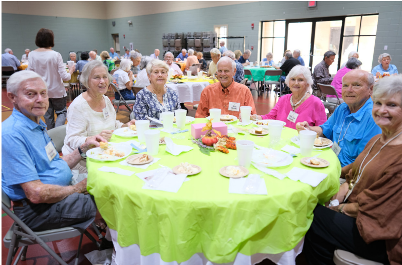
The company at the luncheons is always the top highlight.