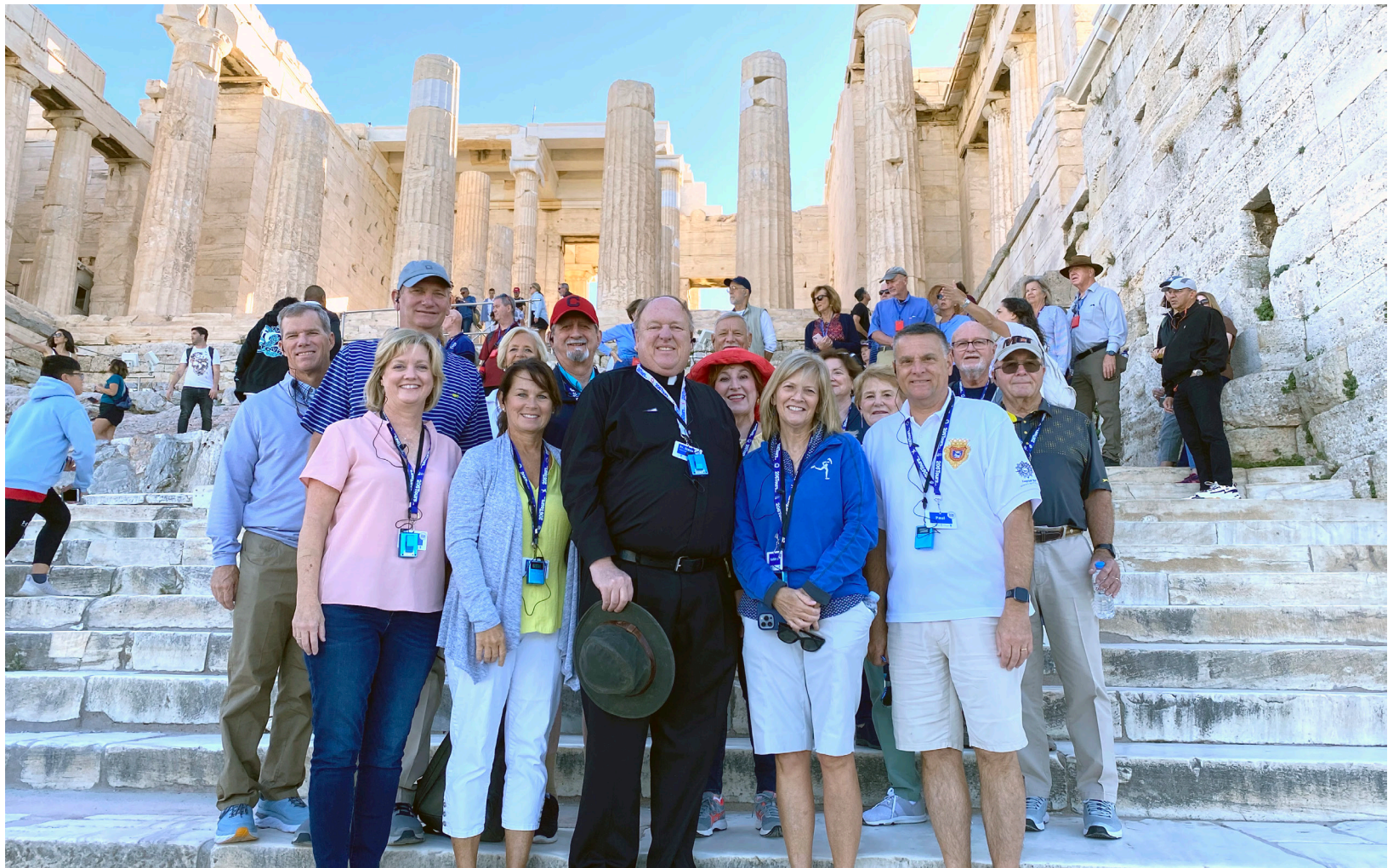
The pilgrims visit the Acropolis in Corinth where Paul preached.