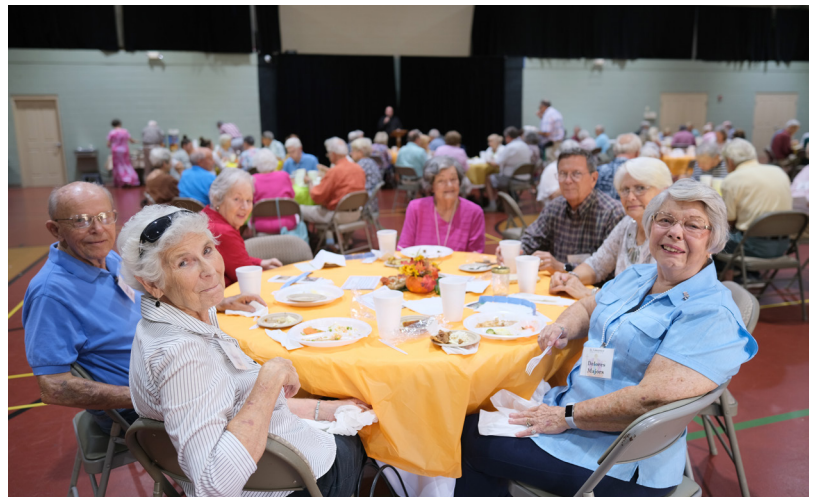
Make sure to join all the fun next month on November 7th!