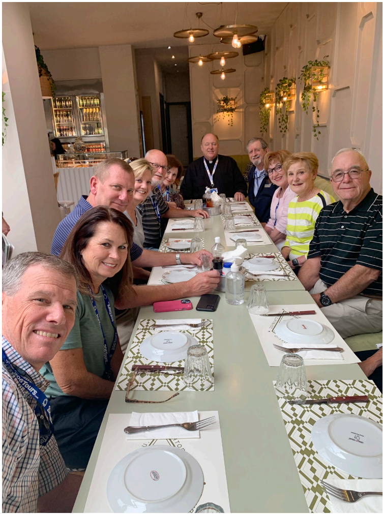
Our pilgrims enjoyed many things like the gyro meat and Greek salads.