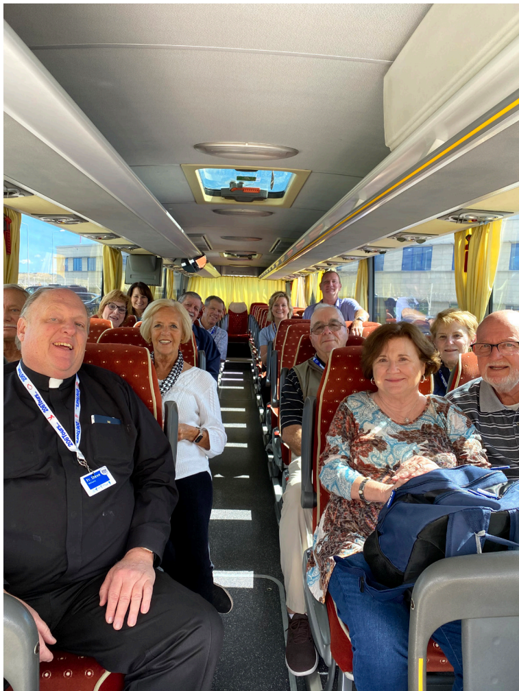
Our group traveled to both Greece and Turkey.