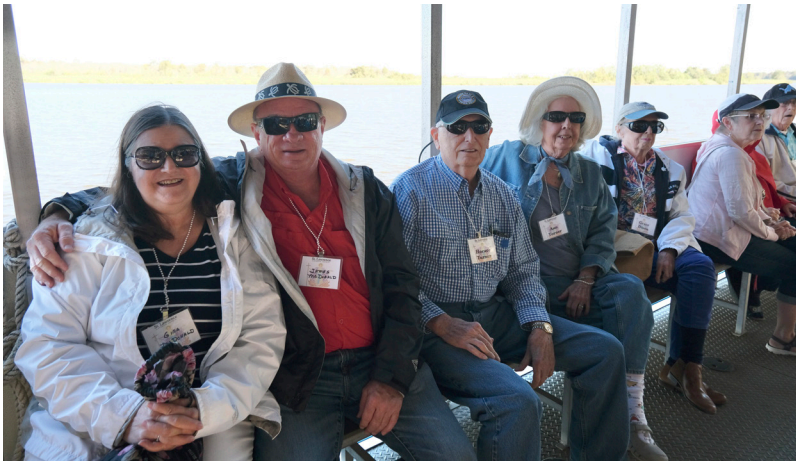
It was a mild and cool day for an outing on the bay.

were very knowledgeable on the topic of the waterways, the ecology of the delta, and the historic ghost fleet. The Mobile-Tensaw Delta is one of the most biodiverse places in the US and the world, and has even been deemed "America's Amazon." The Ghost Fleet or Tensaw Fleet was an armada of mothballed Liberty Ships and other Navy crafts that were parked on the Tensaw after World War II. During its peak, there were 347 ships in port. The weather was breezy and cool and we all had a fabulous time on our two hour cruise. We hope you will be joining us on the upcoming trips in the months ahead.