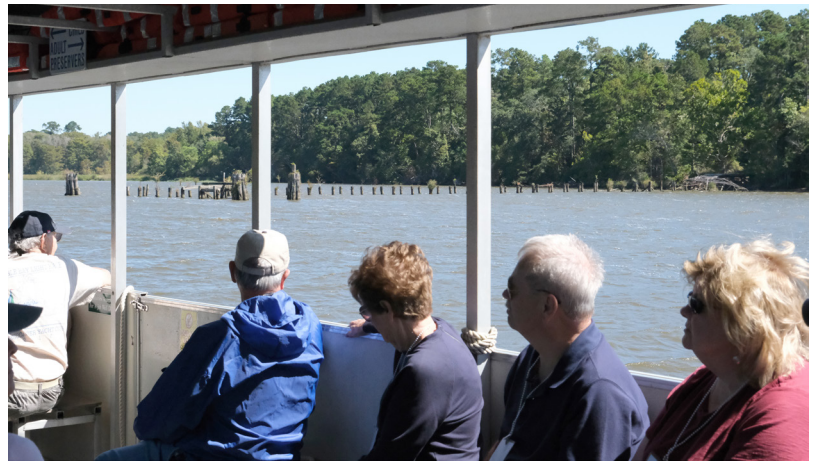
We passed by the decayed remains of the piers and moors for the Ghost Fleet.