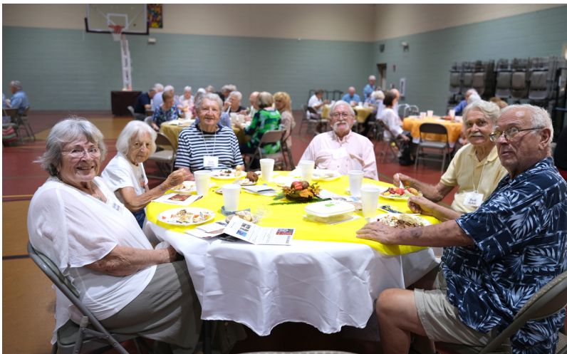
We have had an excellent turnout for the first two luncheons.