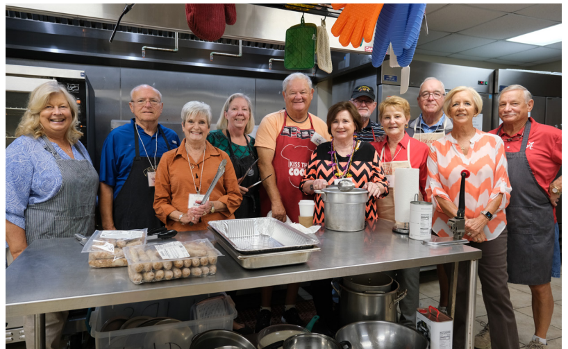
Our cooking crew is second to none!