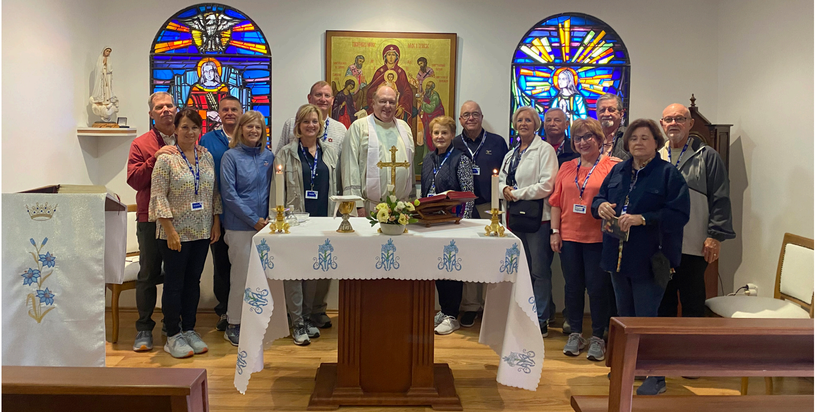
A special moment offering Mass at the home of Mary.