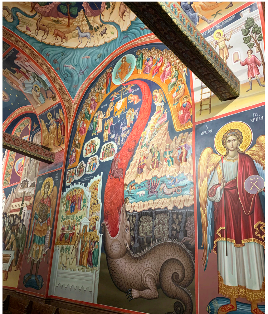
The pilgrims enjoyed visiting a monastery with elaborate frescos.