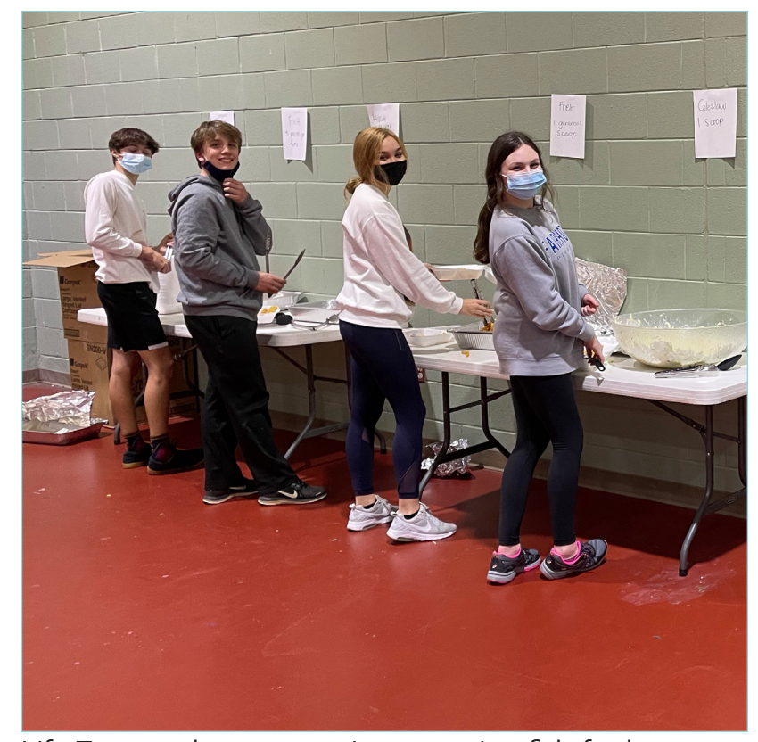
Life Teen students spent time prepping fish fry boxes for pickup.