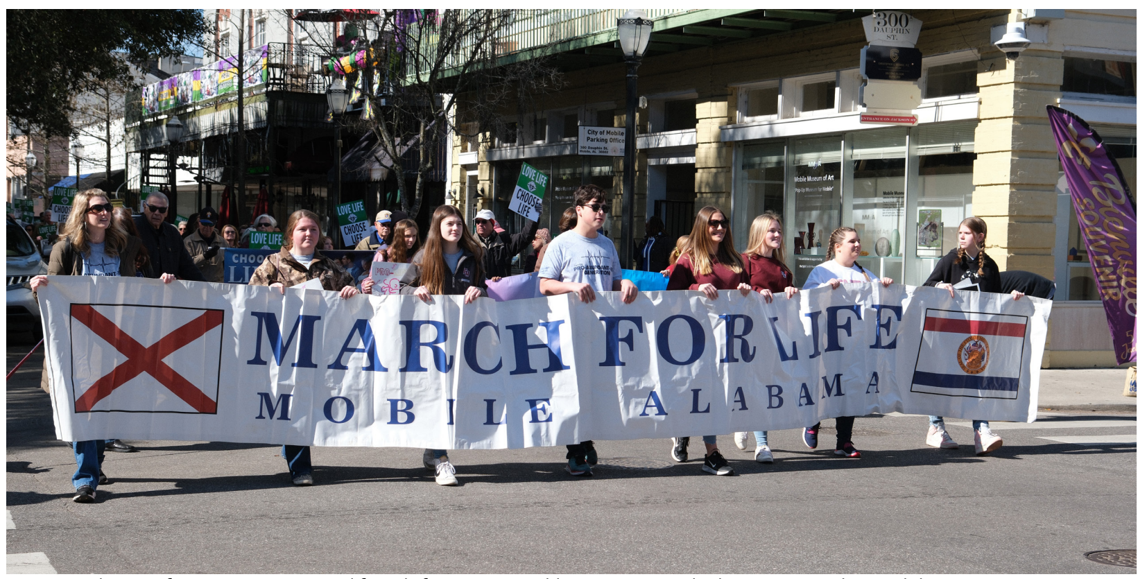
Many parishioners from St. Lawrence and friends from across Baldwin County made the trip to march in Mobile.