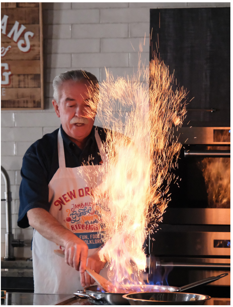
The bananas foster is always the highlight and grand finale of our visit.