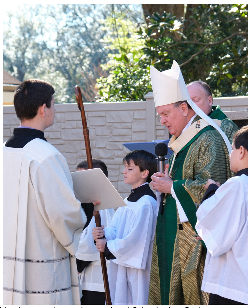
We were pleased to have Archbishop Rodi join us to offer Mass and a blessing over the newly completed Columbarium Project.