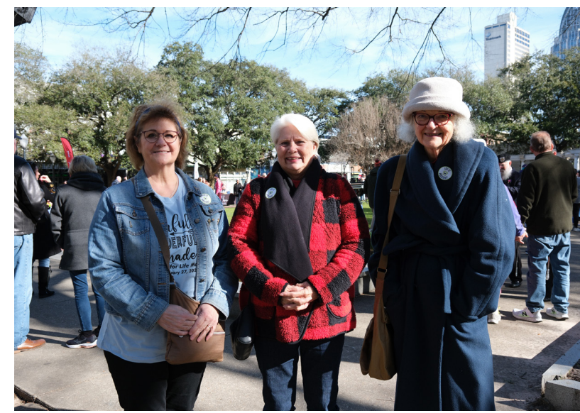
We are so thankful for the parishioners who traveled to join the march in Mobile.