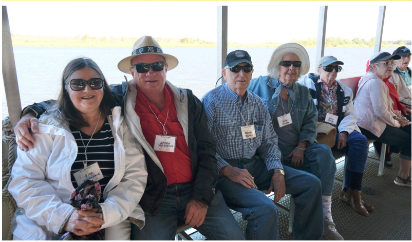
It was a mild and cool day for an outing on the bay.

were very knowledgeable on the topic of the waterways, the ecology of the delta, and the historic ghost fleet. The Mobile-Tensaw Delta is one of the most biodiverse places in the US and the world, and has even been deemed "America's Amazon." The Ghost Fleet or Tensaw Fleet was an armada of mothballed Liberty Ships and other Navy crafts that were parked on the Tensaw after World War II. During its peak, there were 347 ships in port. The weather was breezy and cool and we all had a fabulous time on our two hour cruise. We hope you will be joining us on the upcoming trips in the months ahead.