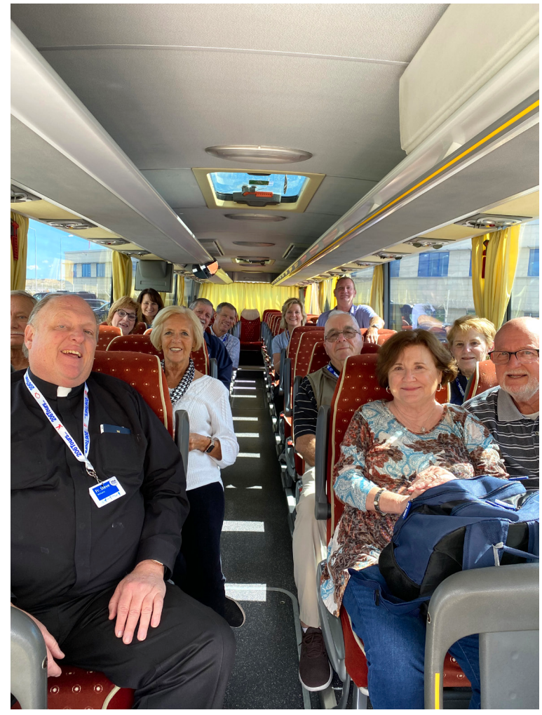
Our group traveled to both Greece and Turkey.