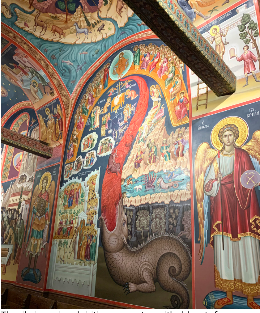
The pilgrims enjoyed visiting a monastery with elaborate frescos.