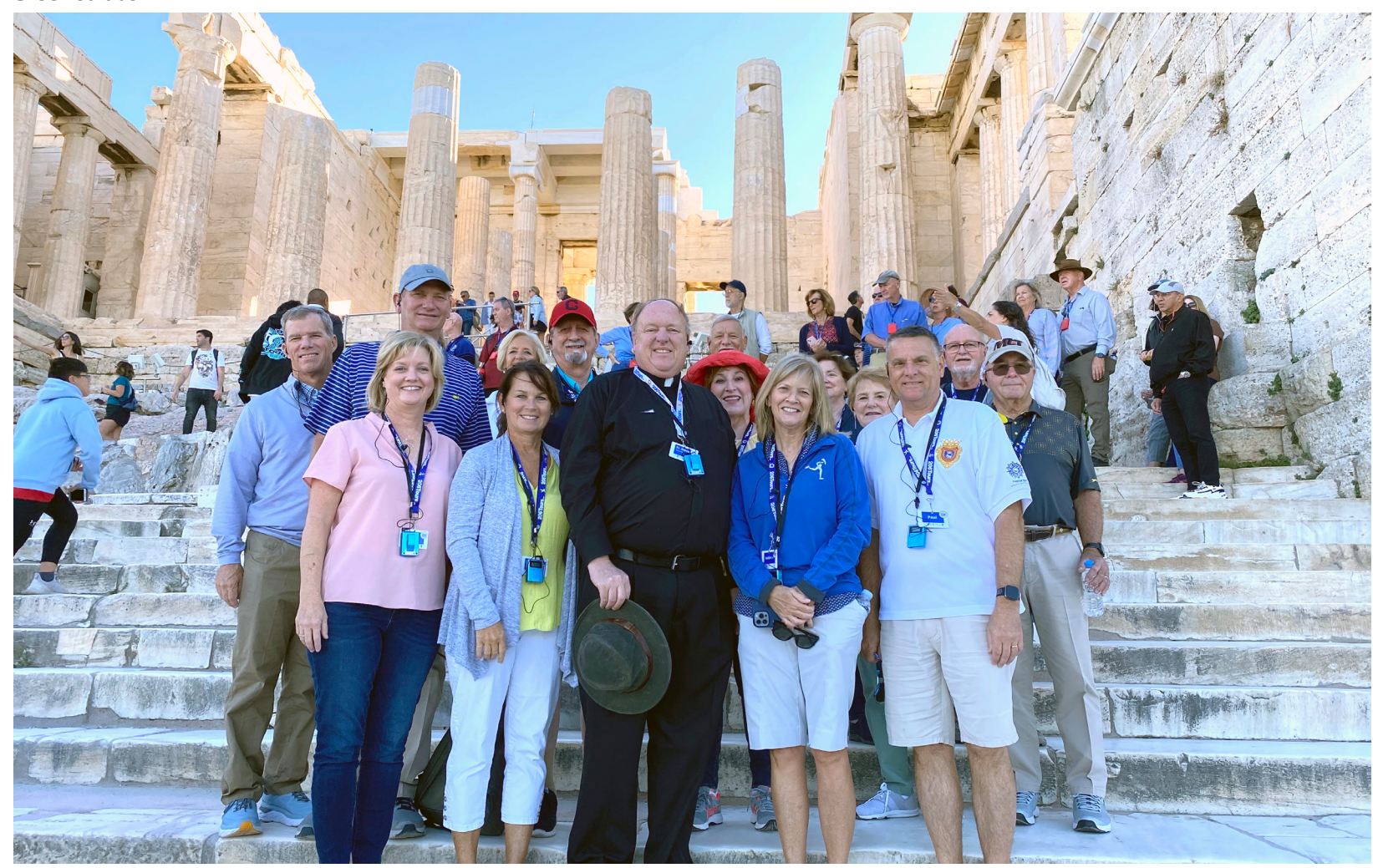
The pilgrims visit the Acropolis in Corinth where Paul preached.