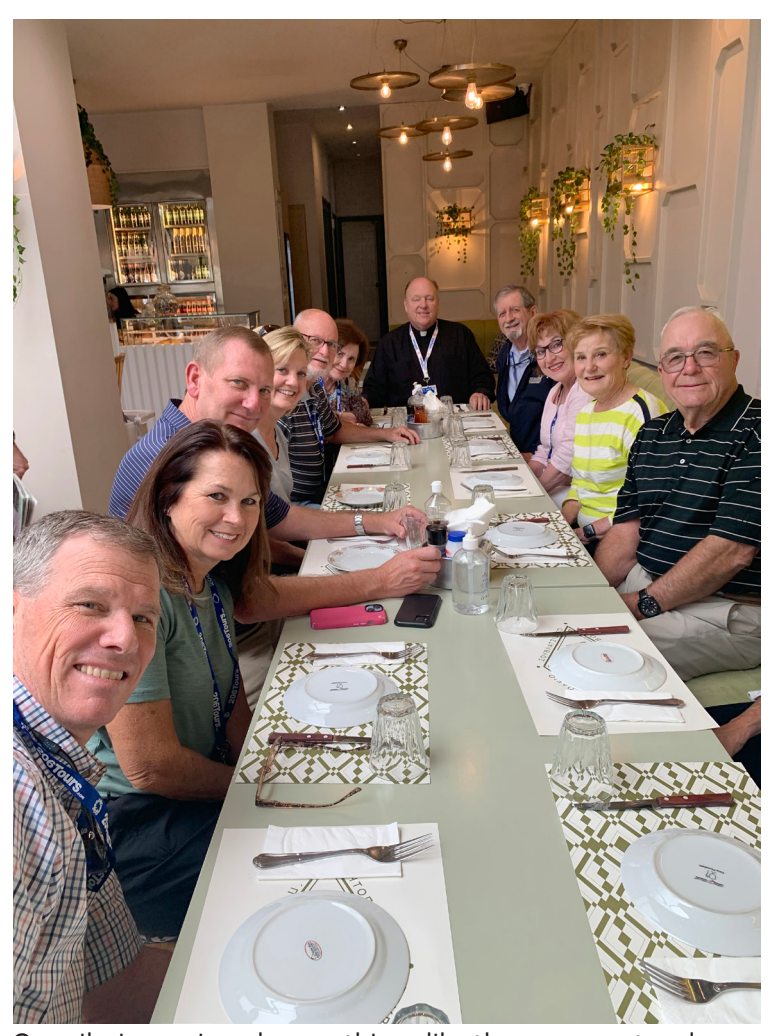
Our pilgrims enjoyed many things like the gyro meat and Greek salads.