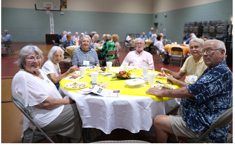
We have had an excellent turnout for the first two luncheons.