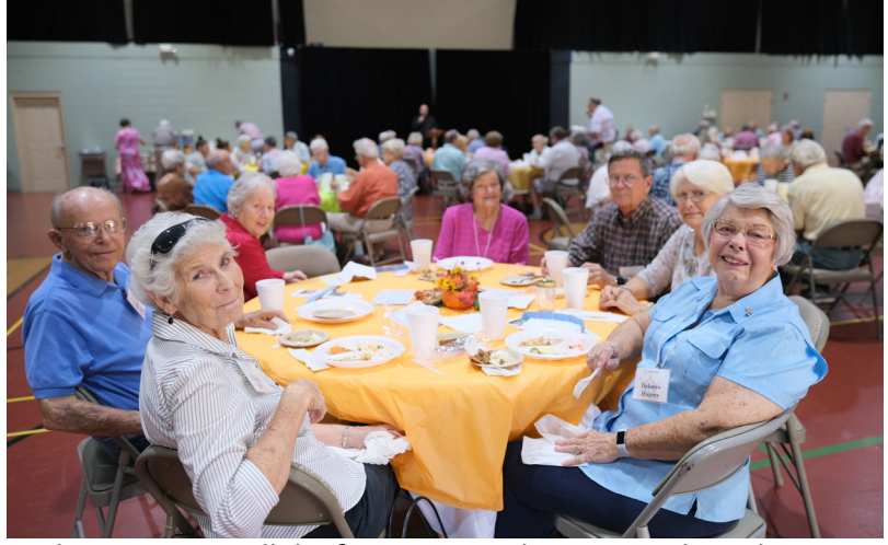
Make sure to join all the fun next month on November 7th!