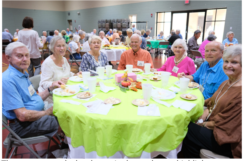
The company at the luncheons is always the top highlight.