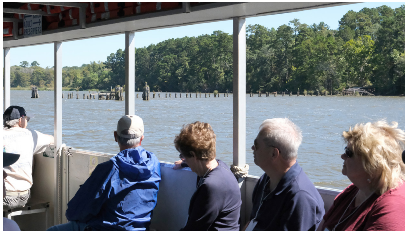
We passed by the decayed remains of the piers and moors for the Ghost Fleet.